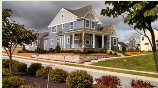
The new Sadsbury Park model home is scheduled to open in November 2014.

The new residents are particularly excited about the dog park as